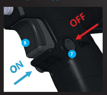
Lock the trigger 6 when the tool is not in use.

To lock the trigger, push trigger lock 7 at OFF site, the tool will not operate.