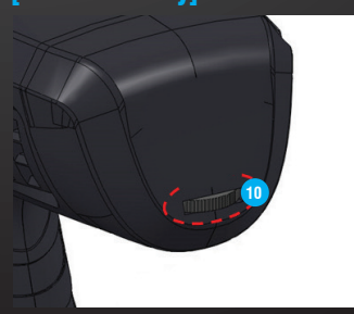
Turn the disk from Left (Low) to Right (High) for desired dispensing speed

Maximum achievable speed on the trigger once the desired speed is set on the disk.