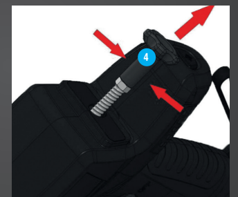
Hold the pull knob and pull it back