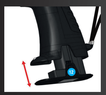
To remove the battery pack, press the battery release buttons and pull. 12.

To load the battery pack, slightly push the battery pack upward to the handle housing.