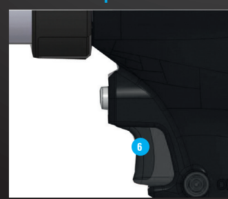
Press trigger 6 to dispense caulk.