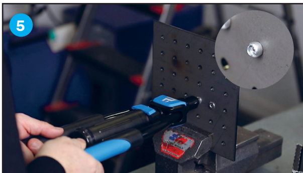
5 Close the arms of the pliers to set the rivet. Repeat the operation if necessary until the rivet mandrel breaks.