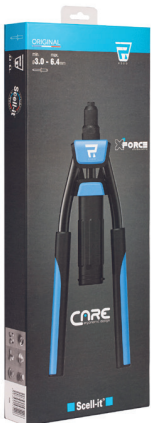
Cardboard box : 505x185x45mm Reference : R300