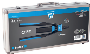
Aluminium box: 520x235x45mm Reference: R300-S