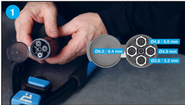
1 Choose the nosepiece corresponding to the diameter of the rivet to be set (nosepieces are stored under the collecting bowl)