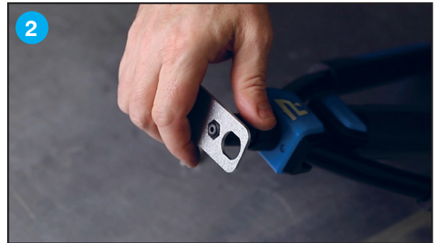
2 Screw the nosepiece onto the nosepiece holder on the tool until it stops (key provided)