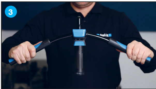
3 Fully spread the gripper arms