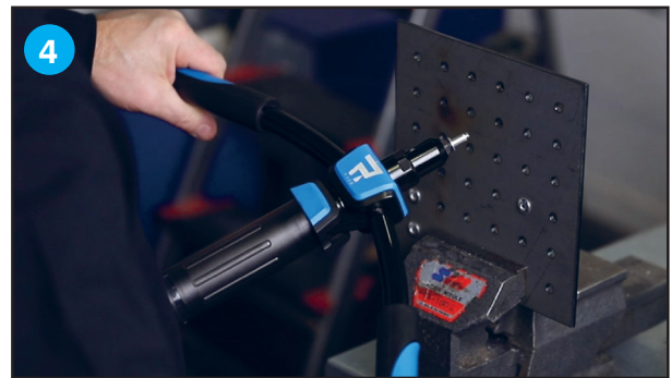
4 Insert the rivet mandrel into the nosepiece of the tool and the body of the rivet into the hole of the material to be assembled