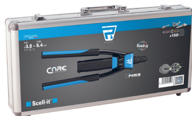
Aluminium box : 520x235x45mm Reference : R300-S

included: 1 R300 tool 4 nosepieces Ø3.0 to 6.4 1 mounting key 1 additional set of jaws Assortment of rivets (R300-S box version)