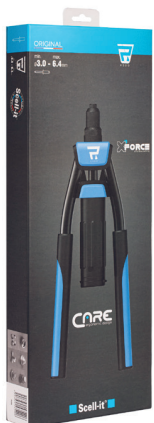
Cardboard box : 505x185x45mm Reference : R300